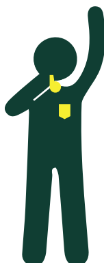
INDIRECT FREE KICK