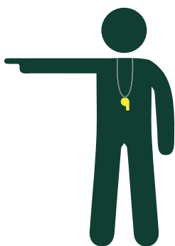
SIX SECOND COUNT