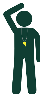
EXCEEDING HEAD HEIGHT