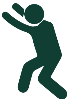
MAIN ADVANTAGE 2