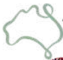
OLIVIA ADAMS (SA)