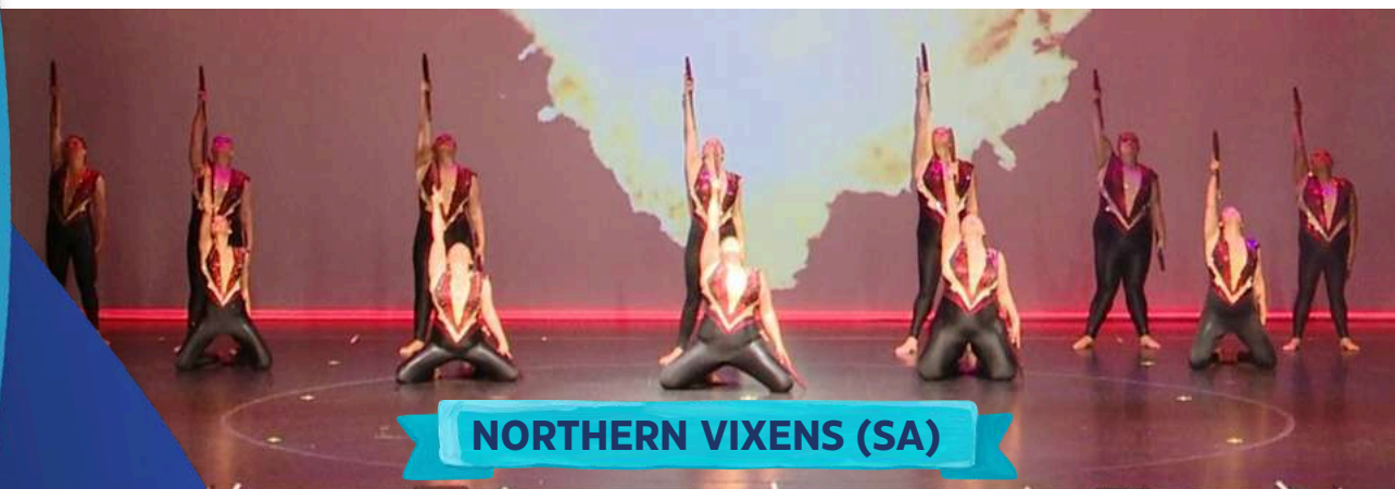
NORTHERN VIXENS (SA)