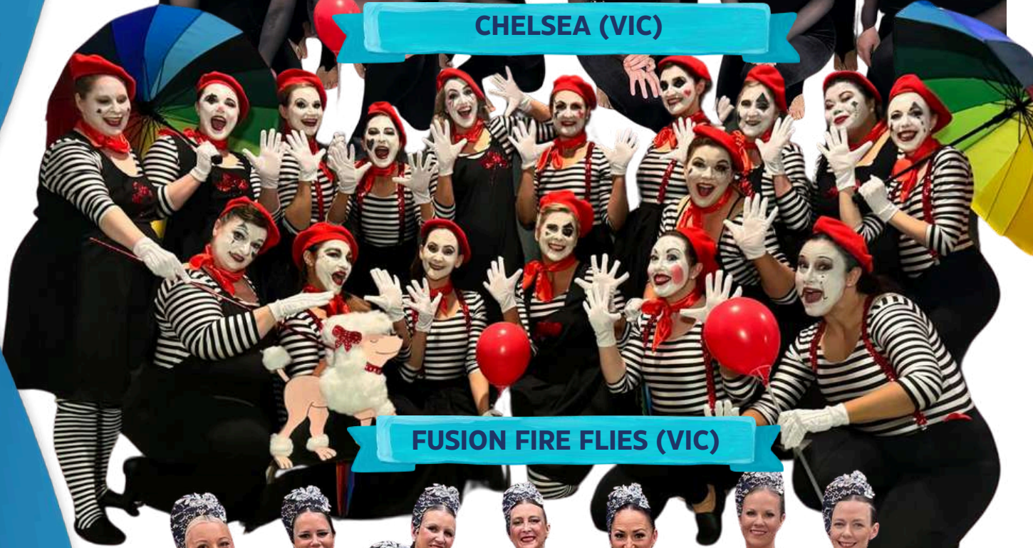
FUSION FIRE FLIES (VIC)