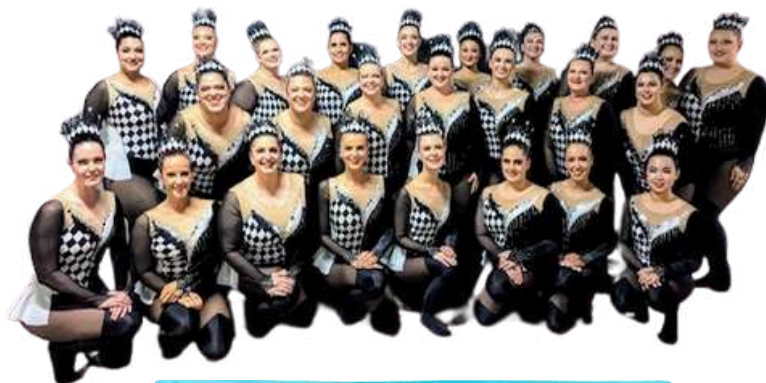
EMMANUEL EMERALDS (VIC)