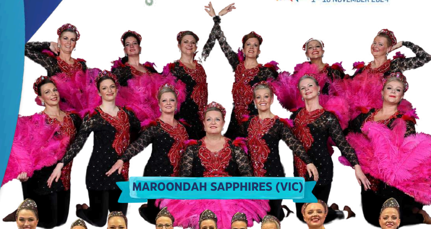
MAROONDAH SAPPHIRES (VIC)

PAN PACIFIC MASTERS GAMES GOLD COAST AUSTRALIA 1 - 10 NOVEMBER 2024