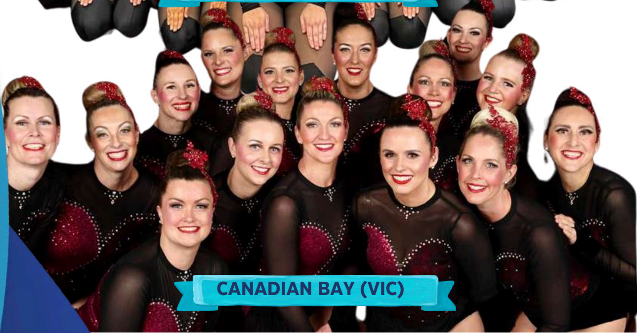
CANADIAN BAY (VIC)