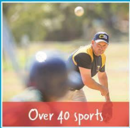
Over 40 sports