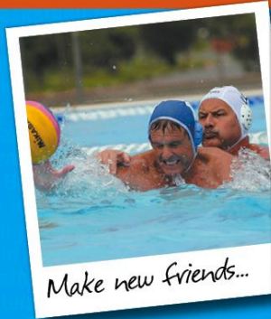
Make new friends...

Come to the Gold Coast in 2012 and... Play it, Live it, Love it!