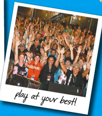
play at your best!