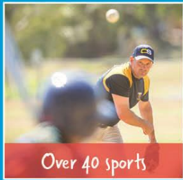
Over 40 sports